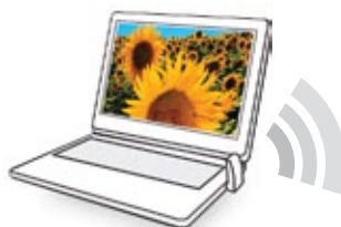
Wireless point-to-point connectivity of up to 30 feet / 10 meters between PC or laptop and DisplayLink enabled projector