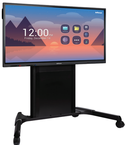
DisplayView works with any InFocus panel or projector released since 2016.

DisplayView gives you detailed analytics of your entire deployment from the convenience of a central location